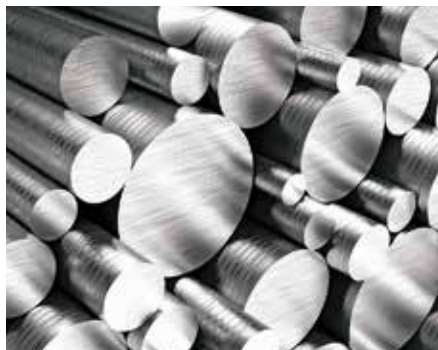
Sorting aluminium raw materials