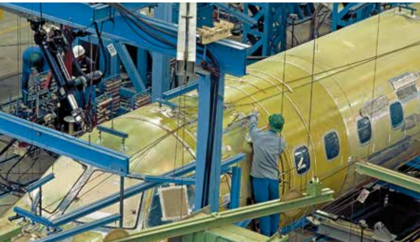
Measuring the electrical conductivity is an important element of quality assurance in the manufacture, maintenance and repair of aircraft

The SIGMASCOPE® SMP350 measures the electrical conductivity using the phase-sensitive eddy current method, which is approved by both DIN EN 2004-1 and ASTM E 1004 for determining conductivity. This kind of signal evaluation allows for contact-free determination of a substrate's electrical conductivity, even under paint or plastic coatings up to 500 µm thick. This method also marginalises the influence of surface roughness.